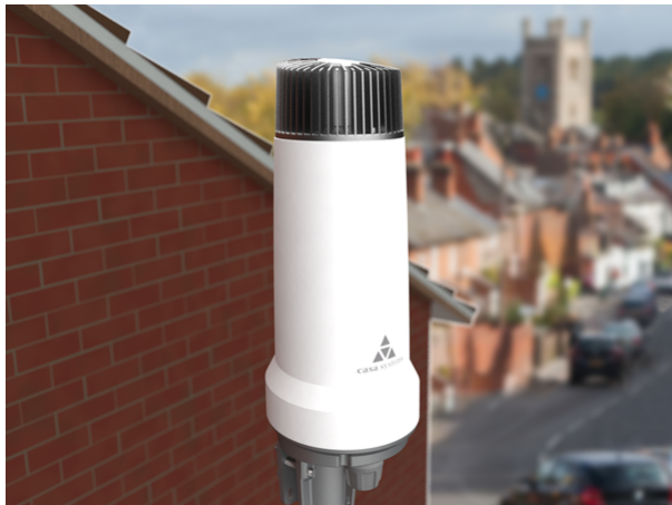
The AurusAI from Casa Systems, the industry's first high-power 5G mmWave device that delivers broadband services wirelessly to homes.

ANDOVER, Mass., Sept. 09, 2020 (GLOBE NEWSWIRE) -- Casa Systems, Inc. (Nasdaq: CASA), a leading provider of cloud-native, virtual and physical infrastructure technology solutions for mobile, cable and fixed telco networks, today announced the AurusAI (Aurus Autonomous Intelligence), the industry's first high-power 5G mmWave customer premise equipment (CPE). Continuing in Casa's long history of fixed wireless access innovation and market success, the devices are key for delivering broadband services wirelessly to homes and apartments nearly anywhere – from remote and rural locations to suburbs and dense, urban areas. Already in multiple trials with global Tier 1 service providers, the initial AurusAI outdoor devices are the first in a portfolio of 5G mmWave CPE that will include a range of outdoor and indoor options.